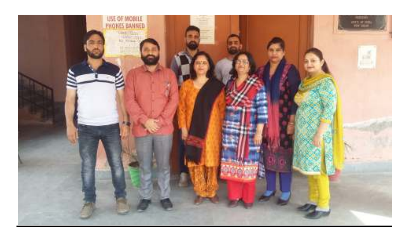
P.G.DEPARTMENT OF FOOD SCIENCE & TECHNOLOGY GROUP PHOTOGRAPH