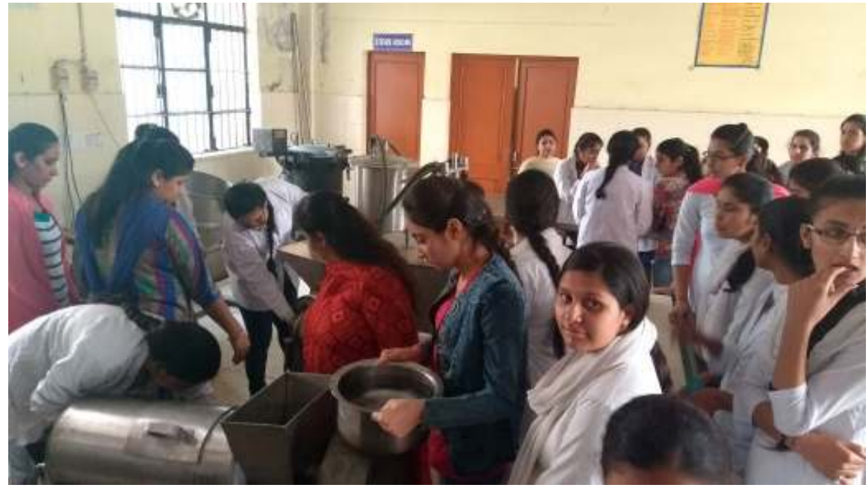
One day workshop and demonstration on processing of fruit & vegetable in pilot plant on 22 November, 2017.