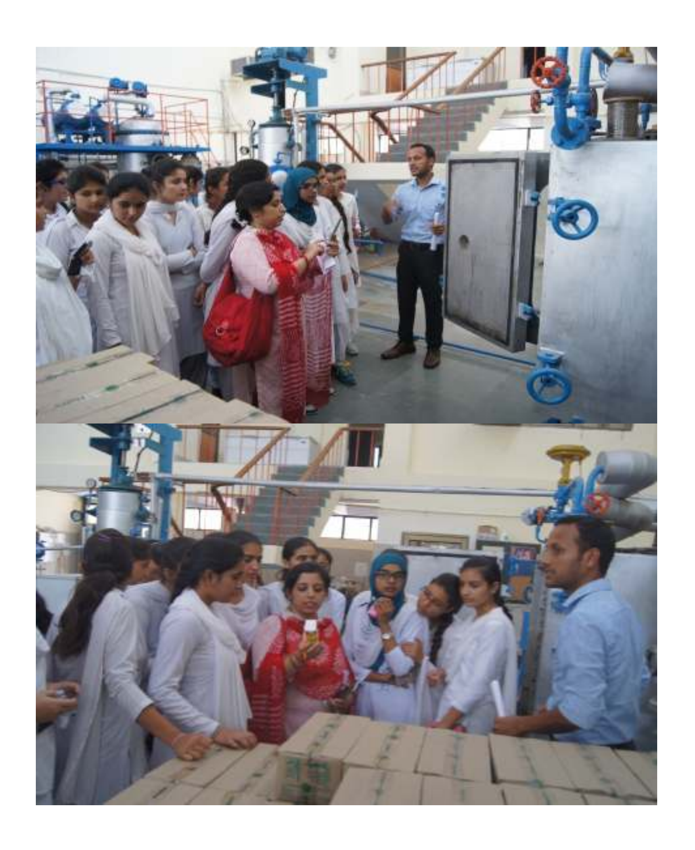
A Visit to IIIM, Jammu was organized for students of U.G. & P.G. on 1<sup>st</sup> of Dec., 2016